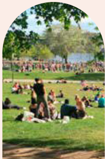
Parks and waterfronts

Nestled in the greenery of Tantolunden, this area offers refreshing lunchtime walks and jogging routes by the water. Here, you'll also find a beach, food trucks, boules and mini-golf. Tantolunden is one of the largest green spaces in the city center and is a true gem all year round.