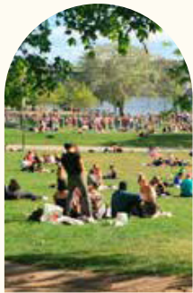
Parks and waterfronts

Nestled in the greenery of Tantolunden, this area offers refreshing lunchtime walks and jogging routes by the water. Here, you'll also find a beach, food trucks, boules and mini-golf. Tantolunden is one of the largest green spaces in the city center and is a true gem all year round.