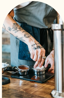
Best coffee in town