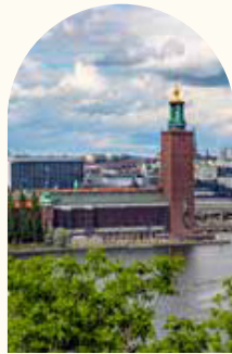
Stockholm's best viewpoint: Skinnarviksberget