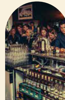
Bars for great After Work